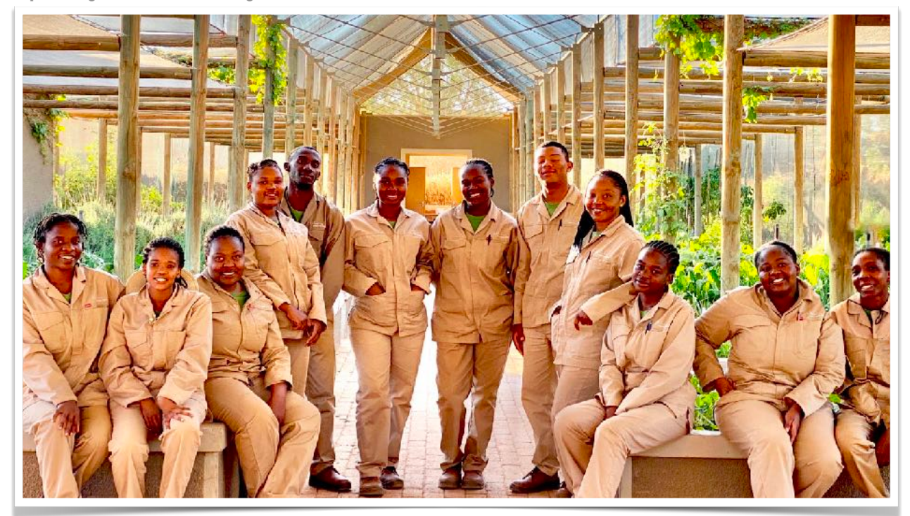
The first Horticulture Group completed their training at Wolwedans in late 2024.

ExpandingVocational Training to Maltahöhe