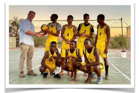
The team receiving nets and Volleyballs

As part of our effort to instil well-being to the community, RR has partnered with the Maltahöhe Volleyball Club.