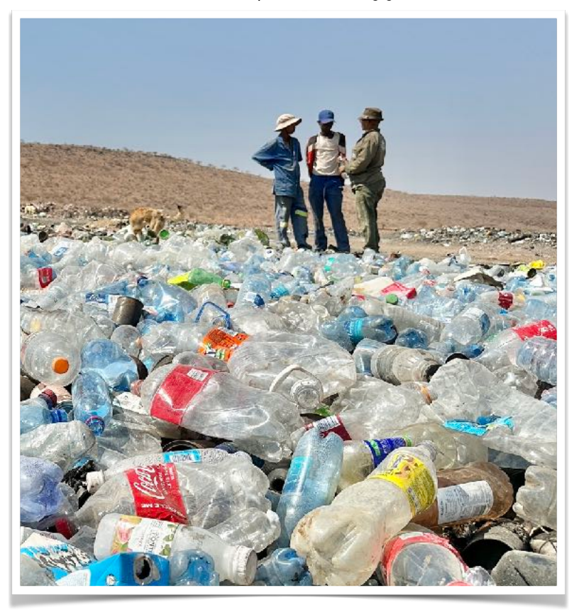
The official landfill site at Maltahöhe is major mine of hidden resources. Metal, plastic, glass and Aluminium - worth a little fortune - awaits harvesting and managing. The landfill site forms Phase 3 of RR Waste Management Initiative and will be addressed as soon as possible.

At RuralRevive, we are pioneering a desert-based economy that's grounded in the principles of a Circular Economy. In simple terms, a circular economy is one that works like a closed loop, where nothing goes to waste.