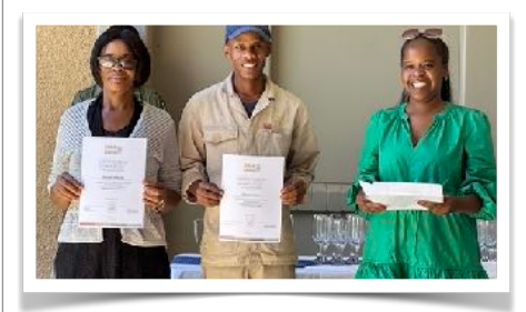
Graduates from the second cohort receiving their Certificates for successful completion of the course.

In 2024, we have seen the success of our EconoMix Program, which empowers aspiring entrepreneurs. The first cohort of seven entrepreneurs is now pursuing various business ventures, each supported with a N$ 2000 grant. Despite a few dropouts, this program has fostered social cohesion and encouraged intergenerational dialogues, helping individuals grow beyond business skills. A second cohort of 10 participants successfully completed their training in October 2024 and are now working on developing their individual business