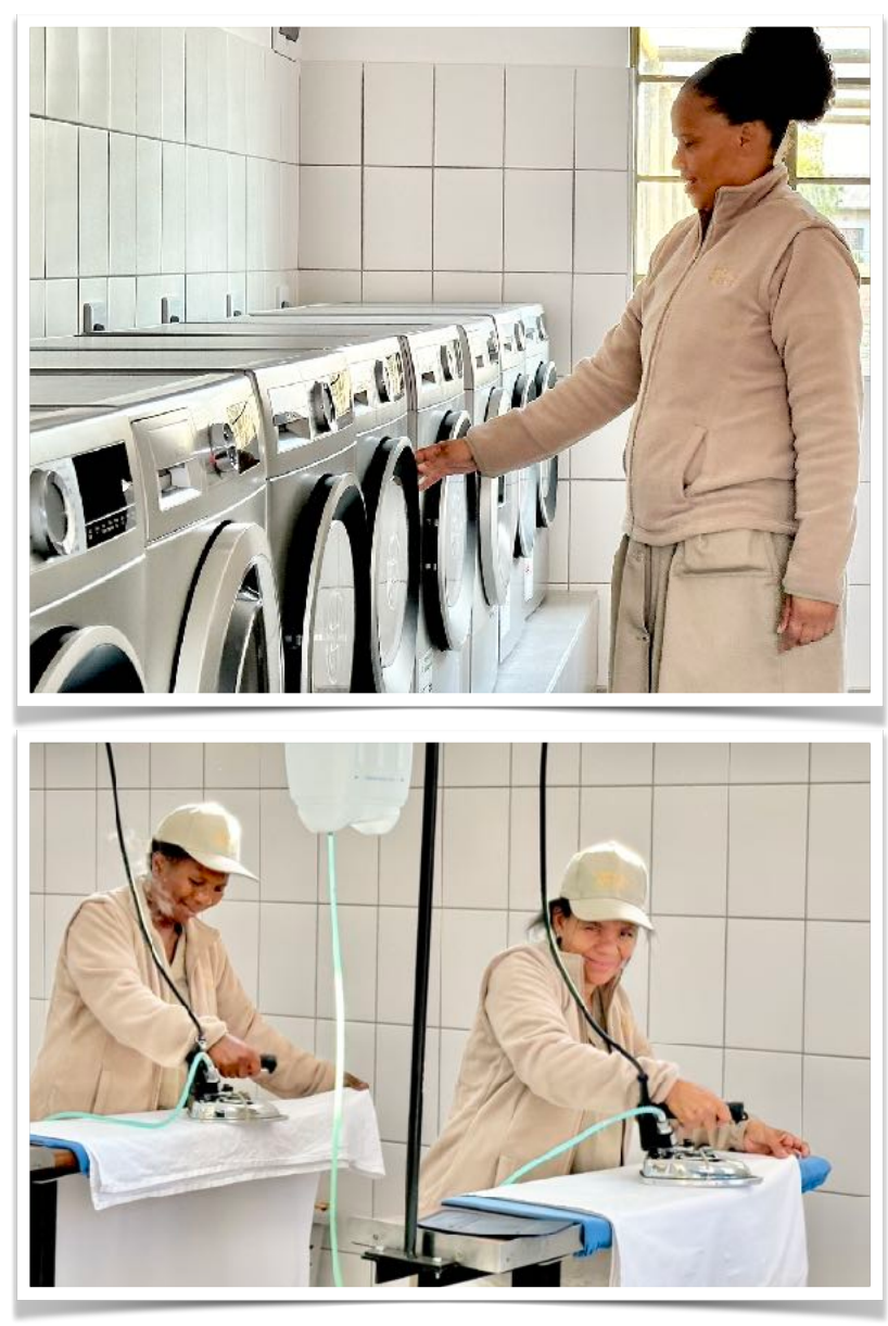
Some of our laundry ladies getting on Charlotte, ?? ?? doing